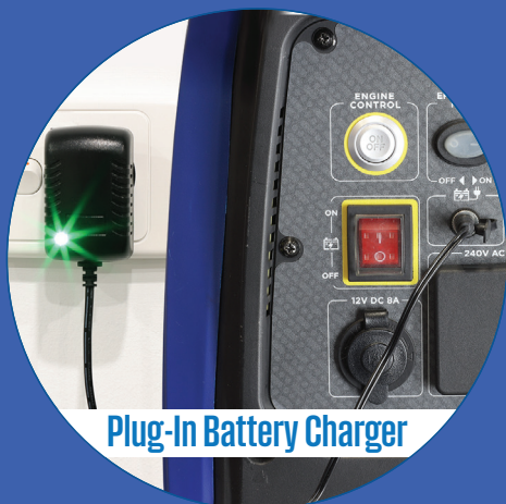
Plug-In Battery Charger