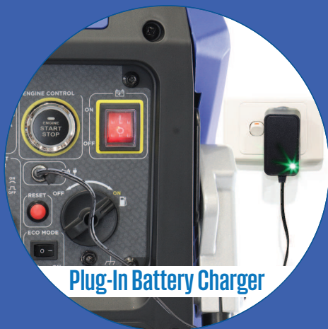
Plug-In Battery Charger